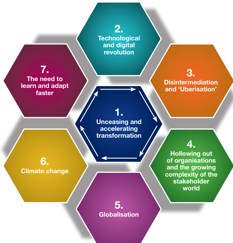
Figure 2. Top challenges organisations believe they will face in the future

These challenges are not separate; they are all interconnected. Each one is driving and being driven by all the others.